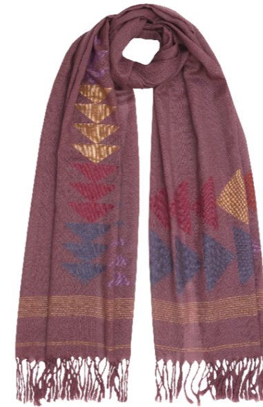
CRC/IHBW/AW23-07 100% WOOLEN STOLE 200X70CM