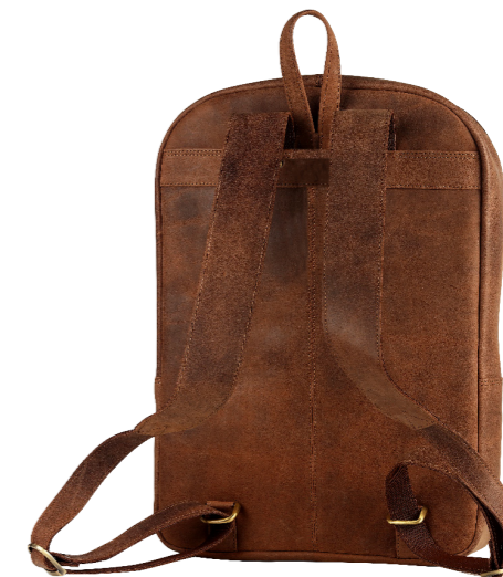
CRC/KCPL/22-1259/3 BACK PACK 45X35X10 CM