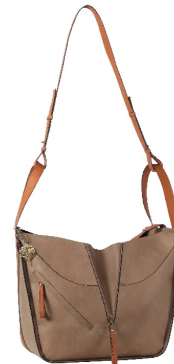
CRC/KCPL/22-10622 SHOULDER BAG 33X33X31 CM