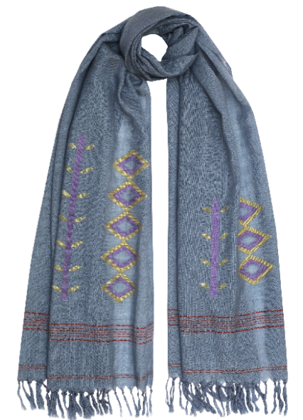
CRC/IHBW/AW23-03 100% WOOLEN STOLE 200X70CM