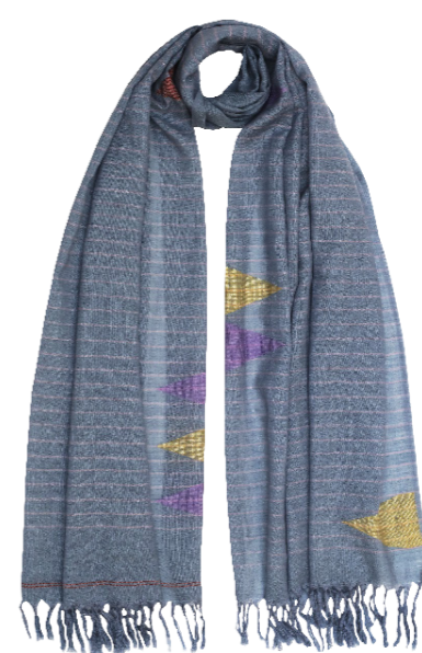
CRC/IHBW/AW23-10 100% WOOLEN STOLE 200X70CM