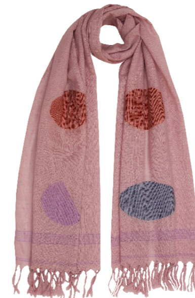
CRC/IHBW/AW23-18 100% WOOLEN STOLE 200X70CM