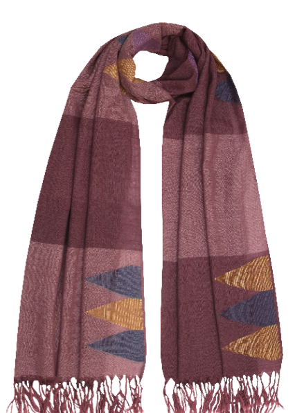
CRC/IHBW/AW23-16 100% WOOLEN STOLE 200X70CM