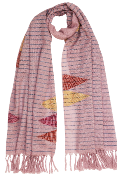
CRC/IHBW/AW23-09 100% WOOLEN STOLE 200X70CM